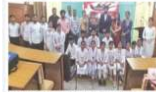
Participants during the awareness talk on legal implications of ragging.