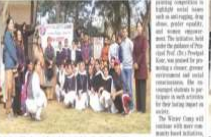
Students and faculty pose for a photograph during the cleanliness drive.