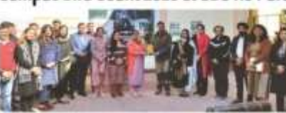
Participants during the Campus Bird Count event.