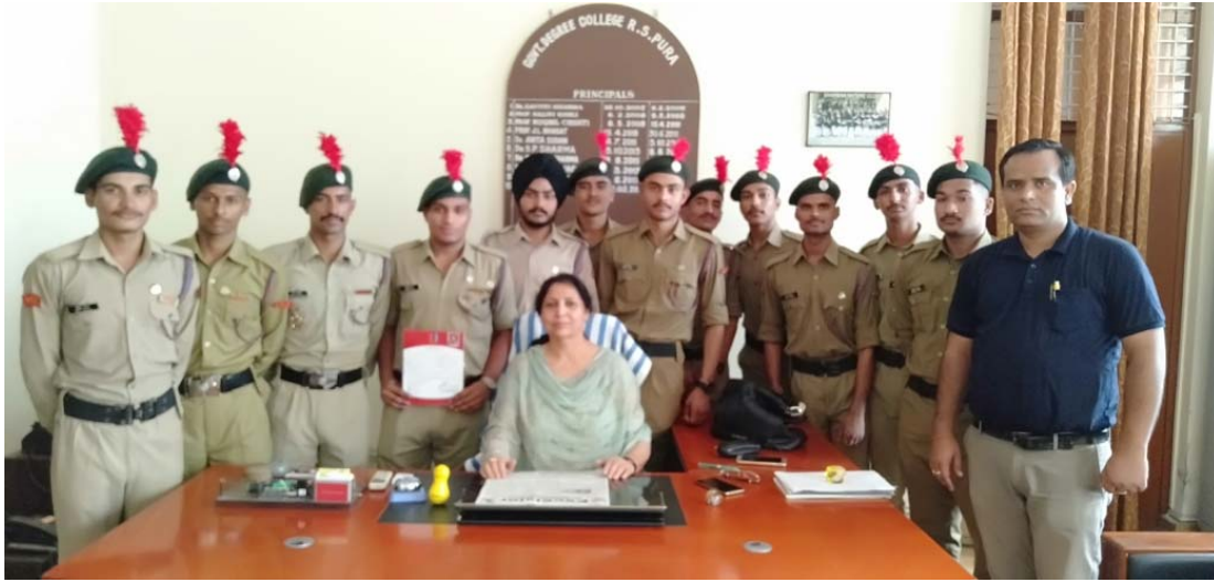
Principal and ANO NCC giving the respective ranks as per Cadets performance