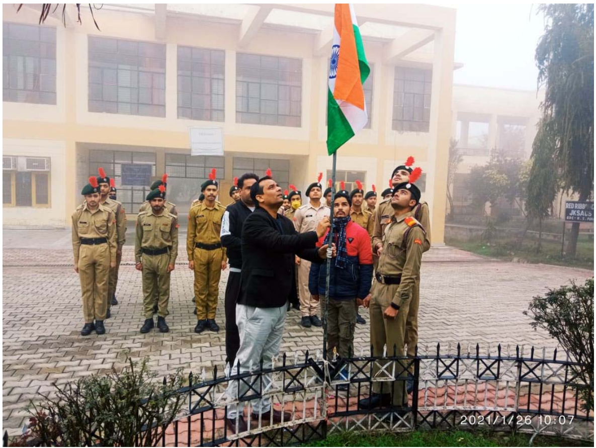
Respective ANO doing the flag hosting as other NCC Cadets line up themselves in the proper way for the National anthem