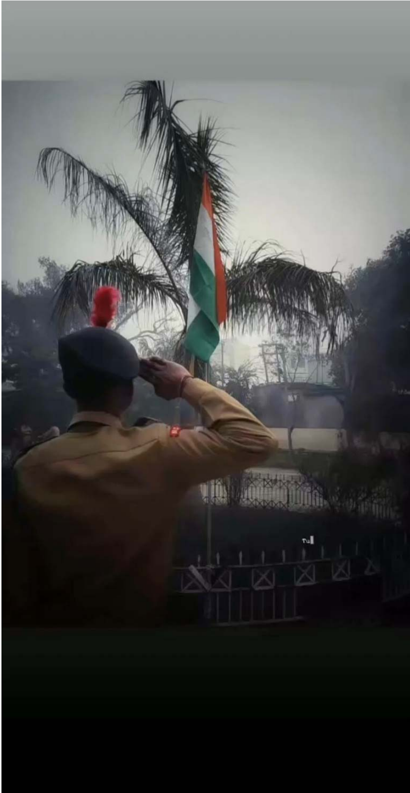
Cadet Saluting, thus pays respect to Indian flag.