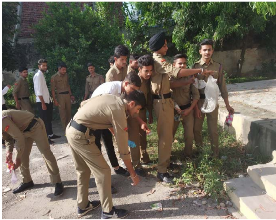
NCC Cadets cleaning college and surroundings on the eve of Swachh Bharat